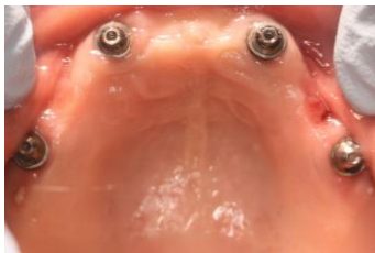
Long Term Bridge