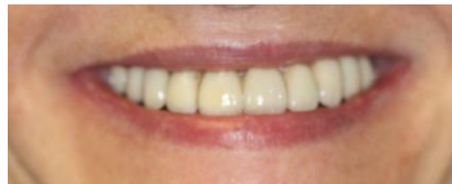
Bridge in Place